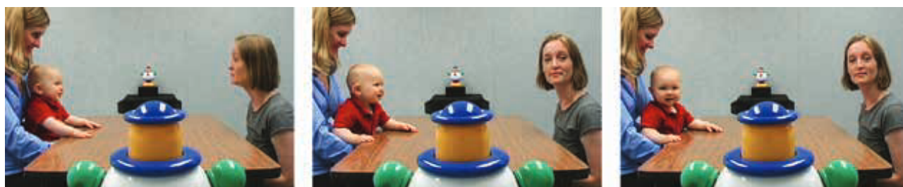
FIGURE 2. Gaze following in babies

The adult first looks at the child, then turns to look at one of the two identical toys. The 1-year-old watches as a researcher turns and then looks to the same object. (From Meltzoff, Kuhl, Movellan, & Sejnowski, 2009, Science , 325, 284–288.)