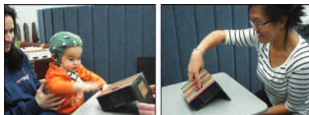
FIGURE 3. Scientists are uncovering the neural bases of infant imitation

Similar brain regions seem to be involved when the infant performs a simple action, such as pushing a button, and when they observe someone else doing so. This result shows the infant social brain in action. (From Marshall & Meltzoff, 2011, Developmental Cognitive Neuroscience , 1, 110–123.)