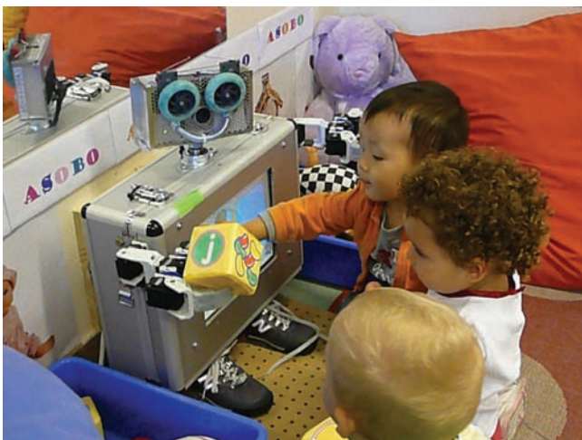
Fig. 4. A social robot can operate autonomously with children in a preschool setting. In this photo, toddlers play a game with the robot. One long-term goal is to engineer systems that test whether young children can learn a foreign language through interactions with a talking robot.

The science of learning has also affected the design of interventions with children with disabilities. Speech perception requires the ability to perceive changes in the speech signal on the time scale of milliseconds, and neural mechanisms for plasticity in the developing brain are tuned to these signals. Behavioral and brain imaging experiments suggest that children with dyslexia have difficulties processing rapid auditory signals; computer programs that train the neural systems responsible for such processing are helping children with dyslexia improve language and literacy (76). The temporal "stretching" of acoustic distinctions that these programs use is reminiscent of infant-directed speech ("motherese") spoken to infants in natural interaction (77). Children with autism spectrum disorders (ASD) have deficits in imitative learning and gaze following (78–80). This cuts them off from the rich socially mediated learning opportunities available to typically developing children, with cascading developmental effects. Young children with ASD prefer an acoustically matched nonspeech signal over motherese, and the degree of preference predicts the degree of severity of their clinical autistic symptoms (81). Children